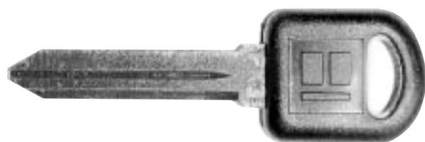
Passkey III (PK3), III+ (PK3+)