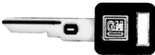
Passkey, Passkey II (PK2)