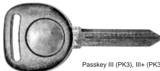
Passkey III (PK3), III+ (PK3+)